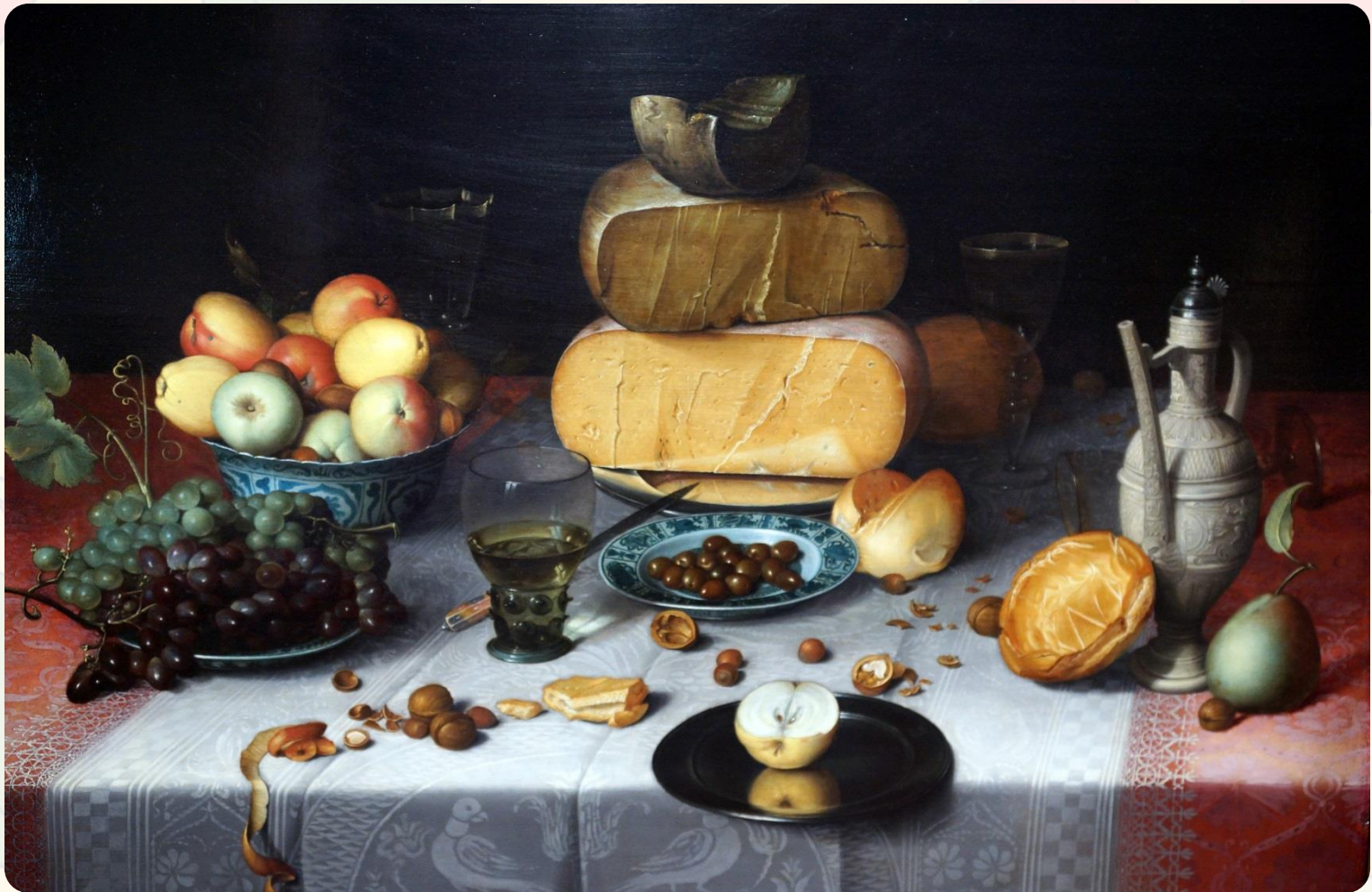
Still Life with Cheese (1615) by Pieter Claesz