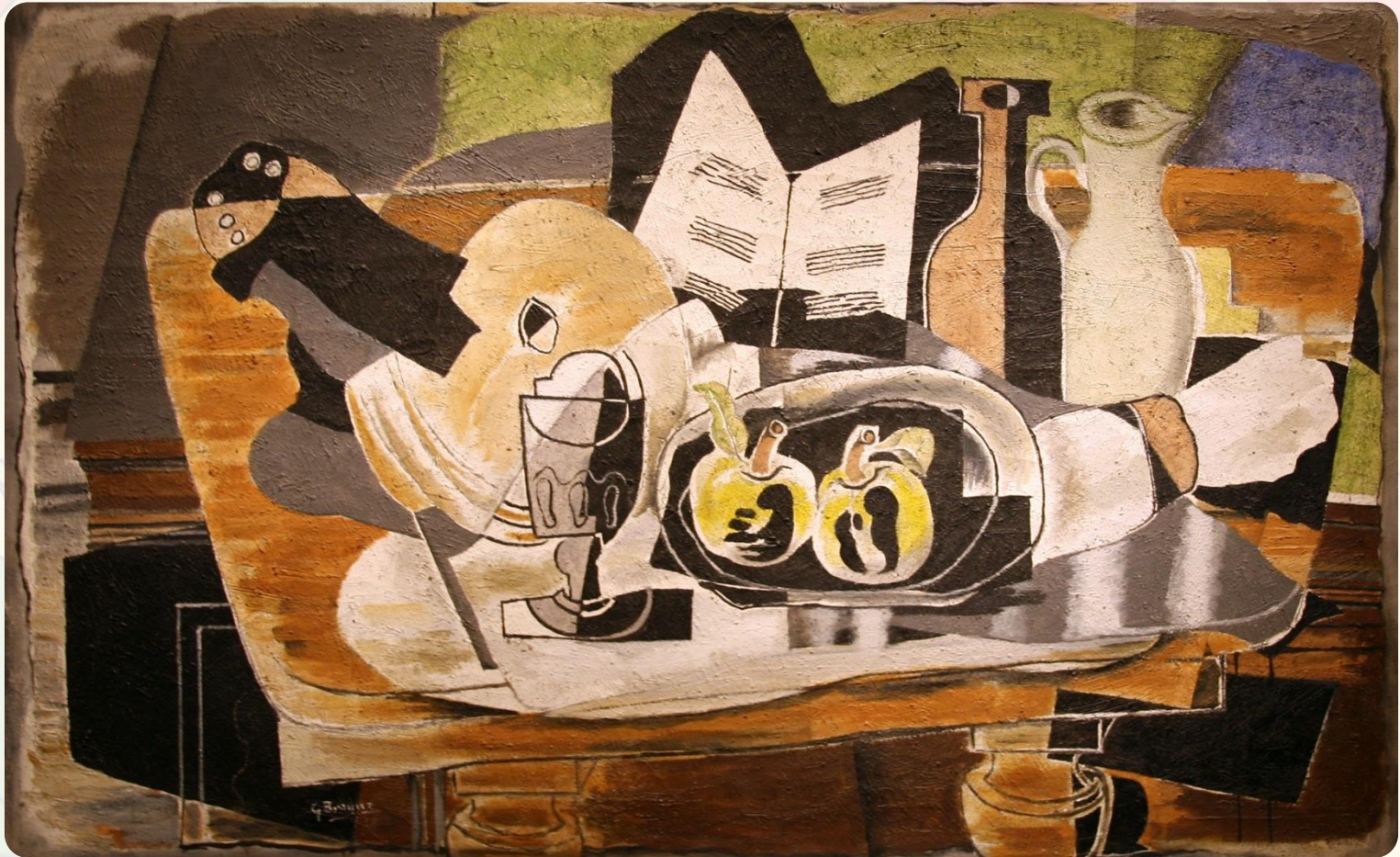
Still Life: The Table (1928) by Georges Braque