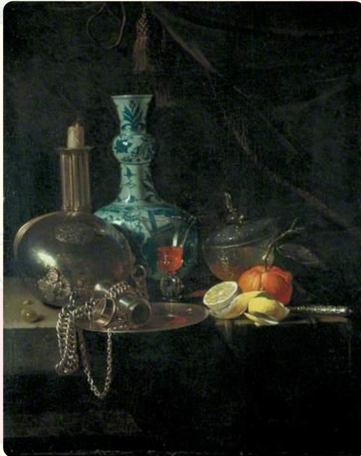
Still Life with a Pilgrim Flask, Candlestick, Porcelain Vase and Fruit by Willem Kalf